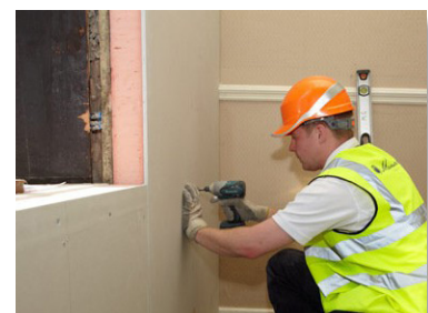
3. Internal Wall Insulation