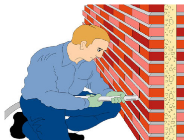
2. Cavity Wall Insulation